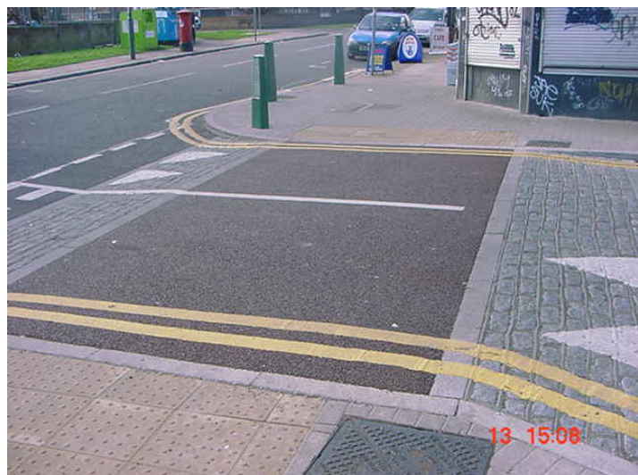
Typical entry treatment